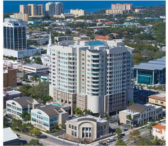
Rivo at Ringling