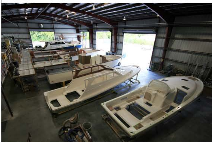
Rivolta Yachts Boatyard

A t Rivolta Yachts, we pride ourselves on making production an interactive process with our clients, while maintaining our commitment to the highest standards. Although semi-custom yacht construction takes considerably more time than building "cookie cutter" boats, recent changes in technology have made the process more efficient all around.